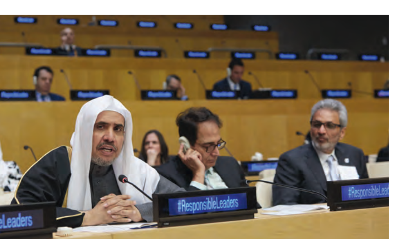
H.E. Dr. Al-Issa speaks on the need for coexistence and tolerance among all religions, faiths and creeds at the Responsible Leaders Summit in New York.

The UN Refugee Agency emerged after World War II to help Europeans displaced by this conflict. Established on December 14, 1950, the agency was given a three-year mandate to complete its work. But the work didn't end. In 1956, UNHCR faced its first major emergency — the flight of refugees from Hungary after Soviet forces crushed its revolution. In following years, displacement grew into a worldwide phenomenon. In the 1960s, decolonization in Africa sparked the continent's first refugee crises, and UNHCR responded. Over the following decades, UNHCR went on to tackle emergencies in Asia and Latin America. By the end of the 20th century, displacement had come full circle.