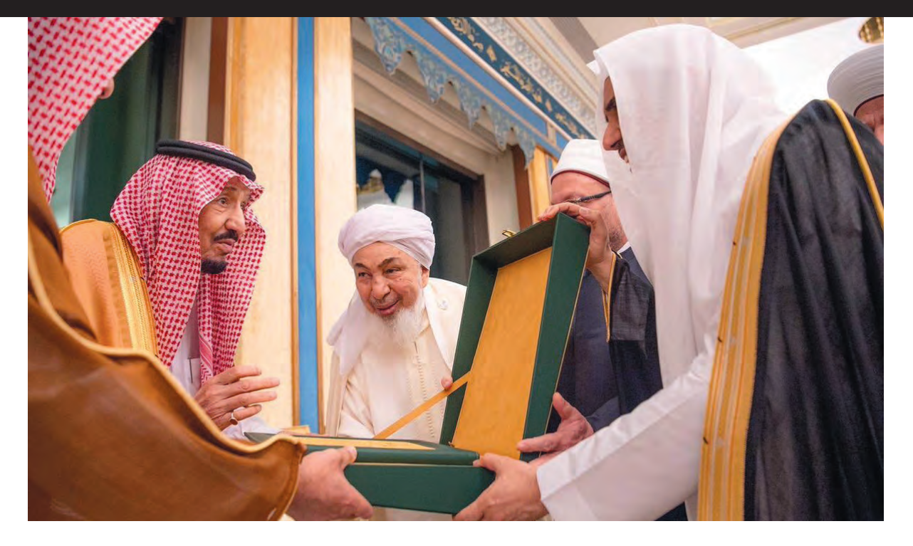
King Salman, H.E. Dr. Al-Issa and Sheikh Abdullah bin Bayyah with the Charter of Makkah — a landmark agreement that offers Muslims with world guidance on the true principles of moderate Islam.

stressed the importance of moderate Islamic discourse and preserve the rights of minorities in non-Muslim countries.