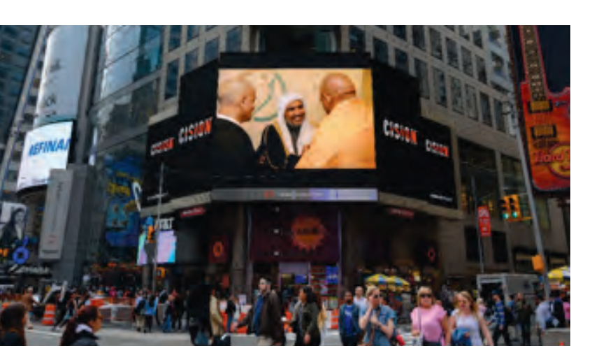
\mbox{H.E.} Dr. Al-Issa "takes Manhattan" and especially much of Times Square, May 1, 2019.

One of the remarkable features of the CRL's Summit was the number of high-profile leaders unified by no