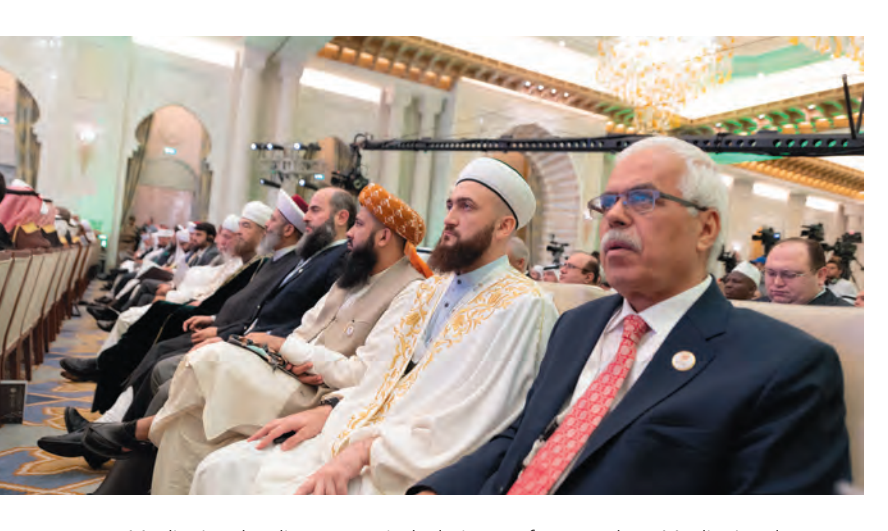
Muslim Leaders listen tentatively during conference where Muslim Leaders agreed to a landmark Declaration on moderate Islam.

21 All world leaders and international organizations should cooperate effectively to achieve safe coexistence among the religious, ethnic and cultural communities of humanity. No individual should be discriminated against based on his or her religion, ethnicity or otherwise when it comes to political, economic or humanitarian assistance.