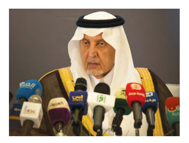
His Royal Highness Prince Khalid Al Faisal addresses Muslim leaders and scholars at global conference on Moderate Islam.

bonds of love between Muslims and fighting the wrong perceptions about Islam. The conference also called on all Muslims to study their religion properly as sent down by Allah, "a religion of love, moderation and authentic values that have contributed to the spread of Islam around the world."