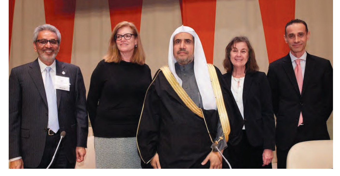
Indefatigable, unstoppable and committed to Responsibility.

Fresh crises emerged in Africa and conflicts in the Balkans created Europe's first refugees since the end of WWII. With the turn of the 21st century, UNHCR has continued its work in Africa (in the Democratic Republic of Congo and Somalia), and is active in Asia, where the Afghan refugee situation marks its thirtieth anniversary.