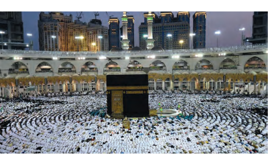
Worshipers at Makkah at Ramadan 2019.

This came during His Majesty's reception of the leading Islamic scholars participating in the conference. As many as 1,200 prominent Islamic figures from 139 countries, representing 27 Islamic components of various sects and schools of thought, endorsed the Charter of Makkah. The objective of the conference was to find actionable methods to advance the tolerant and peaceful principles of Islam among all Muslims, and especially future generations, as well as establish the common values that connect Muslims to cultures around the world.