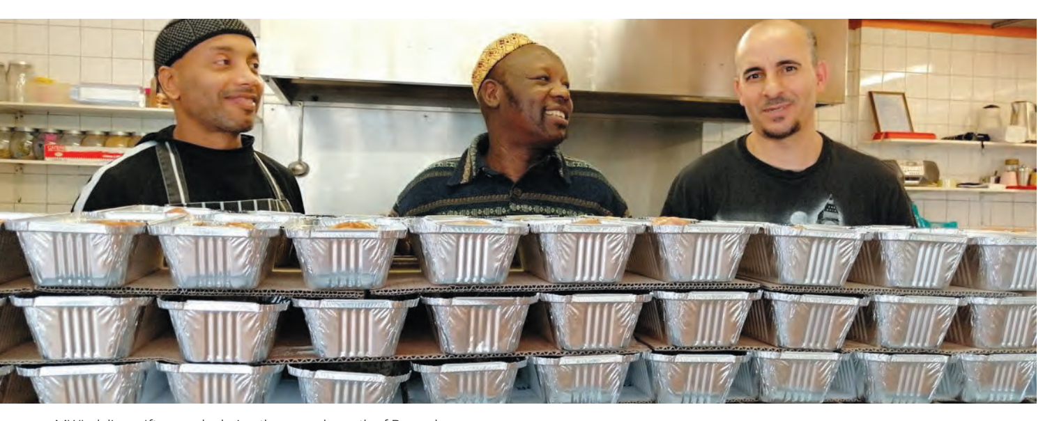
MWL delivers Iftar meals during the sacred month of Ramadan.

According to the MWL, the baskets were distributed primarily in Egypt, South Africa, Jordan, Afghanistan, Bangladesh, Chad, Comoros, Sri Lanka, Lebanon, Djibouti, Sudan, Uganda, Togo, Malawi, Senegal, Mauritania, Tunisia, Bosnia, Somalia and Yemen.