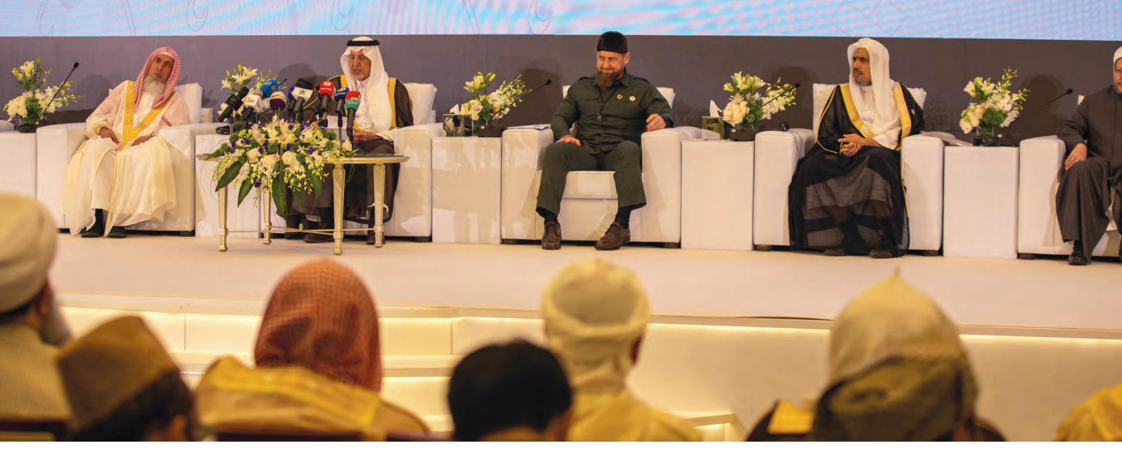
Muslim Leaders gather to Discuss Moderate Islam.