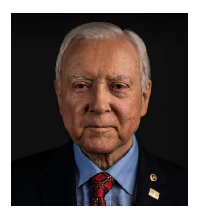
Senator Orrin Hatch (R-UT), the longest serving Republican U.S. Senator in history.

Editorial Staff of the Journal of the Muslim World League | November 2019