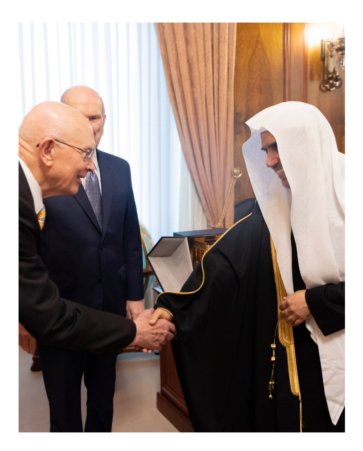
Dr. Al-Issa greeting the First Presidency of Church of Jesus Christ of Latter-Day Saints.

It is therefore fitting that Dr. Al-Issa and the Muslim World League should feel themselves in familiar territory, whether in Salt Lake City, visiting the home of the "first family" of nation's oldest Muslim community in Dearborn, Michigan, or in the political capital of Washington or the cultural capital of New York.